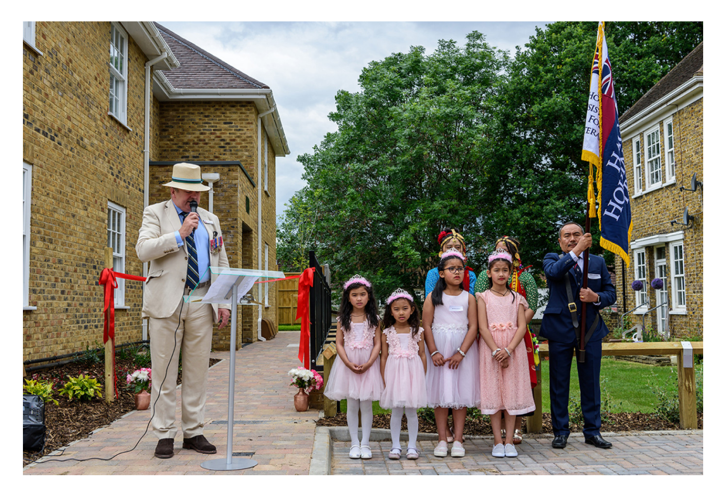
The development is located in Morden, South London.