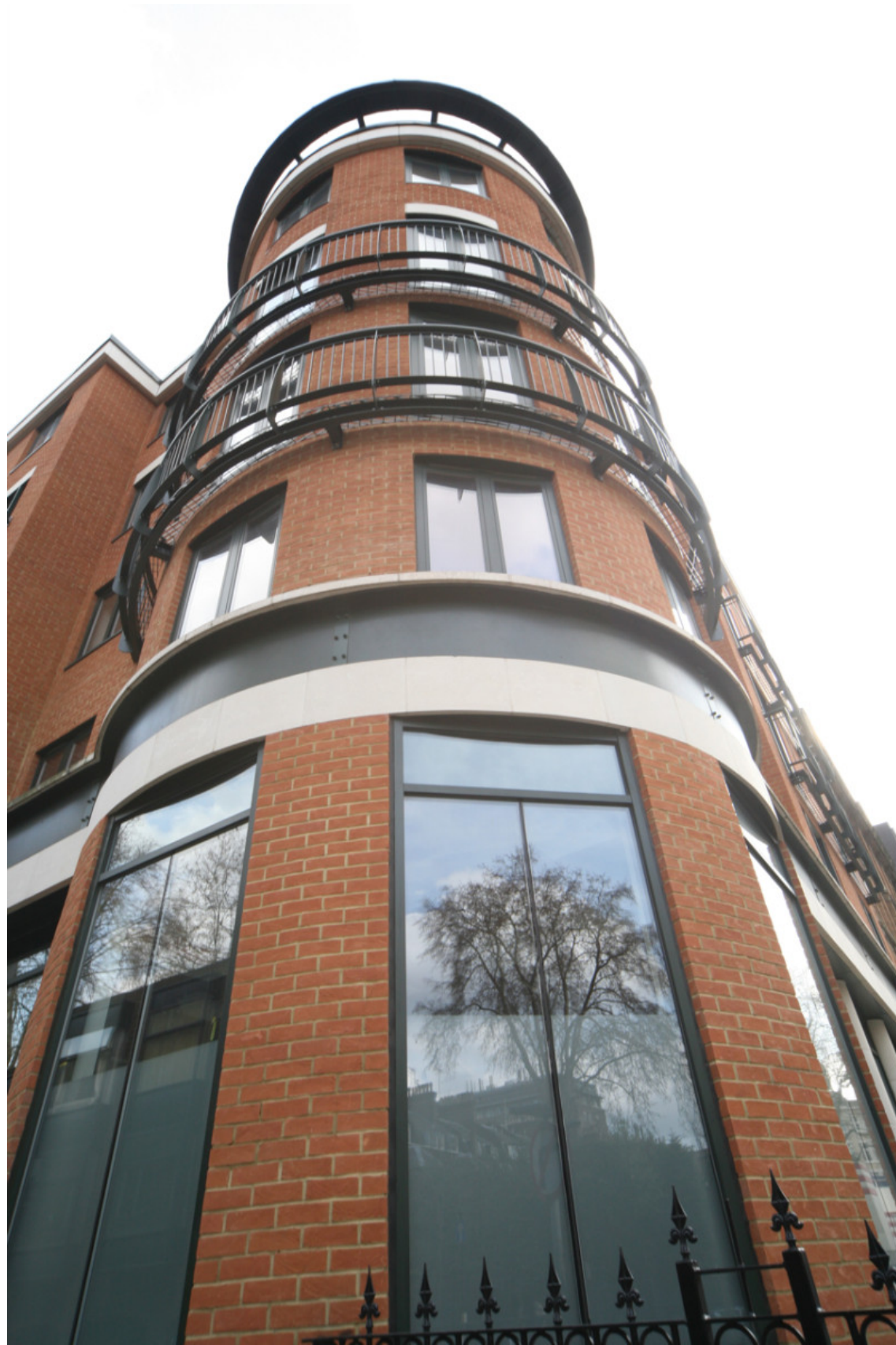
The development is located in the Camden, North London.

This £3.5m mixed use development was a partnership between the Royal Academy of Dramatic Art and Groveworld Developments.